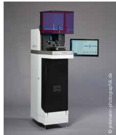
LAwave measuring system for fast and non-destructive characterization of small and medium-sized components.

The development of new applications is ensured by continuous advancement of measurement technology and software. This includes the development of high-temperature resistant sensors and the automation of the measurement and evaluation process. On-site applications and measurements on very large components will be made accessible in future with a mobile measuring head.