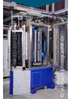
Application examples of the LAwave technology.

large measurement area of about 5 \times 10 \text{ mm}^2 provides integral information. With its high precision, the method is an important alternative to nanoindentation, demonstrating its strengths in areas such as quality assurance of high piece counts and the examination of extremely thin layers in the nanometer range.