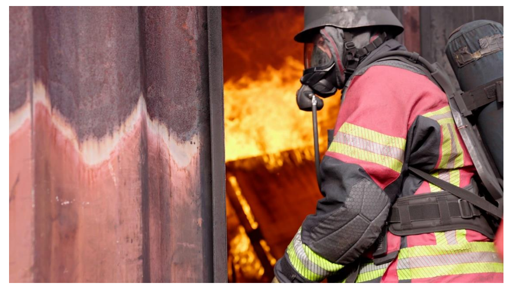
The project partners in "3D-PAKtex" set themselves the goal of better-protecting firefighters from the risks posed by PAH toxins by developing new types of protective suits.