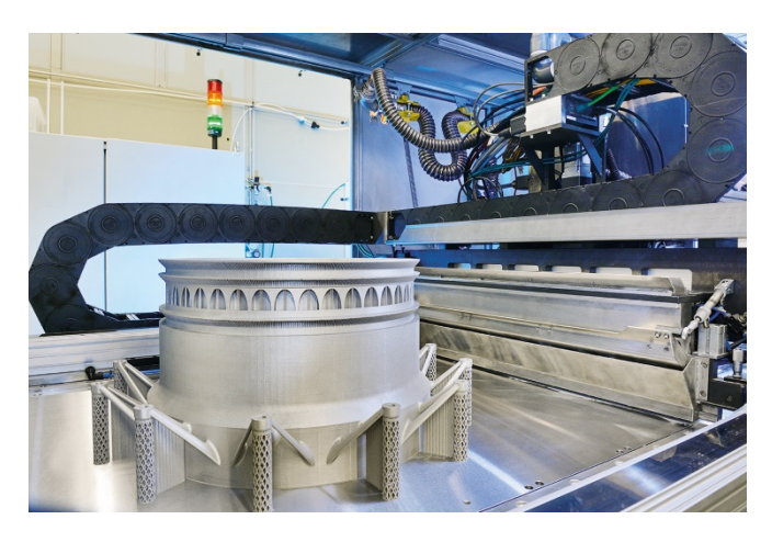
Image 1: Several lasers at Fraunhofer ILT in Aachen use 3D printing to transform metal powder into a demonstrator component for the future generation of Rolls-Royce engines.

Project duration: July 2017 – November 2020 www.futuream.fraunhofer.de