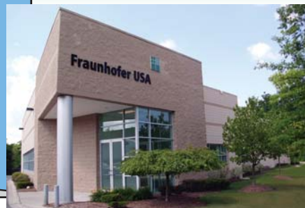
Fraunhofer USA - Laser Applications Division, Plymouth, MI

Fraunhofer USA Center for Coatings and Laser Applications 46025 Port Street Plymouth, Michigan 48170 www.ccl-laser.fraunhofer.org smueller@fraunhofer.org