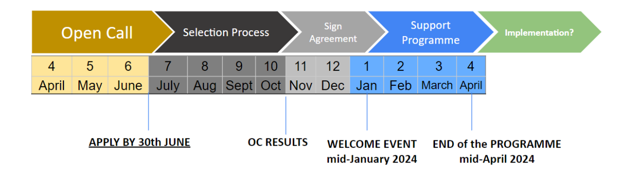
Figure 3 PULSATE 2<sup>nd</sup> AUC tentative schedule